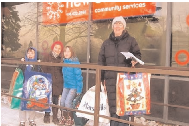
Donors drop off their gifts at New Circles for our Holiday Angel Program 2010.

It was another successful year for Holiday Angels and we extend a huge thank you to all the Angels who participated in the program. 157 families from 38 different countries received much needed household items, gifts and groceries, a 17% increase from last year! The caring that goes into these baskets is obvious to us all and I know the recipient families are always touched that strangers would help them in such a tangible way. Thank you. Please take a look at some of the wonderful thank you letters on the Holiday Angel page on our website www.newcircles.ca Even in this "off season", we are working hard to make the 2011 Holiday Angel Program the biggest and best yet. We have taken some of the fantastic advice and feedback given to us from our Angels in their evaluation of the program and we are working at improving our technology (website, registration and feedback forms). Additionally, we are developing ways to optimize the Holiday Angel drop off day. We thank all the Holiday Angels who provided such constructive feedback and ideas to make the program even better.